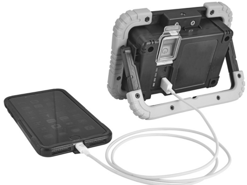
Figure B: Charging Mobile Device (not included) with Work Light/Battery Bank