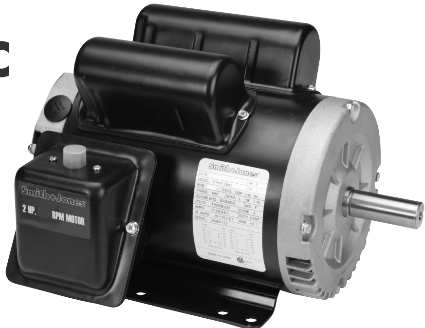
Item 57339 shown.