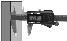
Figure C: Step Measurement

Note: Use the ORIGIN button to set the Caliper to its absolute origin. Press and hold button for 1.5 seconds until readout shows 0.00.