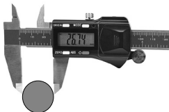
Figure A: Outer Measurement