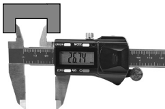
Figure B: Inner Measurement