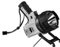
Stand / Hanger

Note: The Spotlight's Stand / Hanger can be adjusted, extended and positioned as desired or hung.