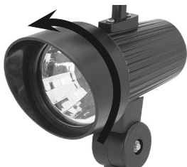
Figure B: Lamp Housing