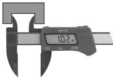
Figure B: Inner Measurement