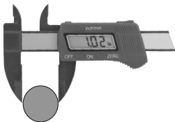
Figure A: Outer Measurement