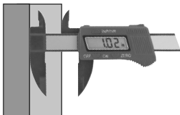
Figure C: Step Measurement