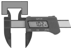
Figure B: Inner Measurement