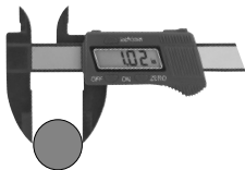
Figure A: Outer Measurement