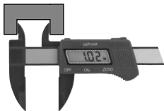
Figure B: Inner Measurement