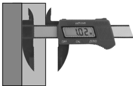
Figure C: Step Measurement