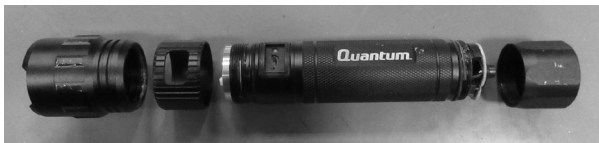
Figure A: Flashlight Structure