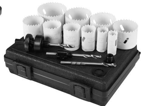
68113 14-Piece Hole Saw Set