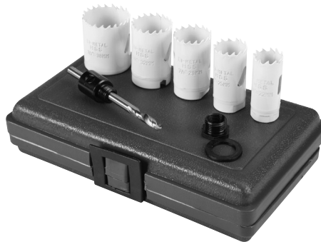
68112 7-Piece Hole Saw Set