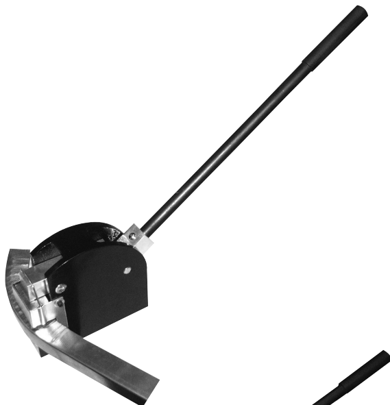
Figure 2 - Shrinker

Note: If bending a flange as shown below, first form the workpiece's 90° angle using a Sheet Metal Brake (sold separately), creating a maximum flange depth of 1".