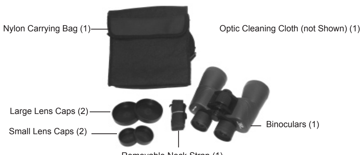
Removable Neck Strap (1)

When unpacking your Binoculars, check to make sure the following items are included. If any items are missing or broken, please call HARBOR FREIGHT TOOLS at 1-800-444-3353 .