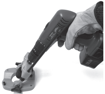
Drilling a hole at an angle