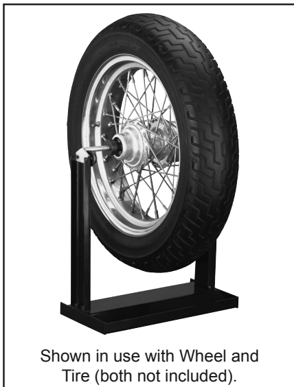
Shown in use with Wheel and Tire (both not included).